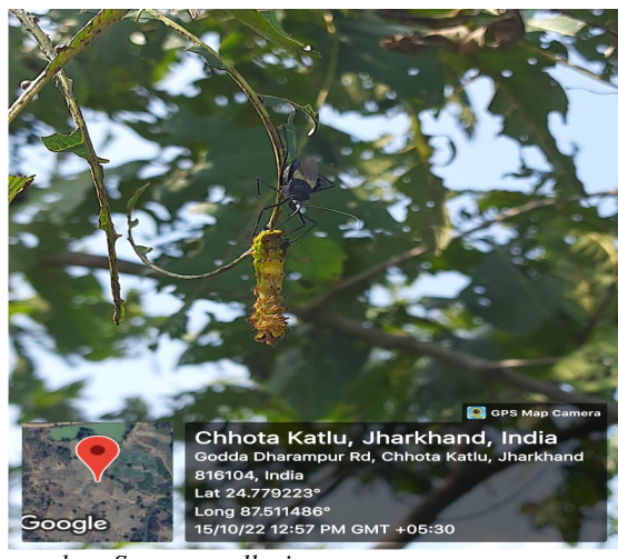
b. Sycanus collaris