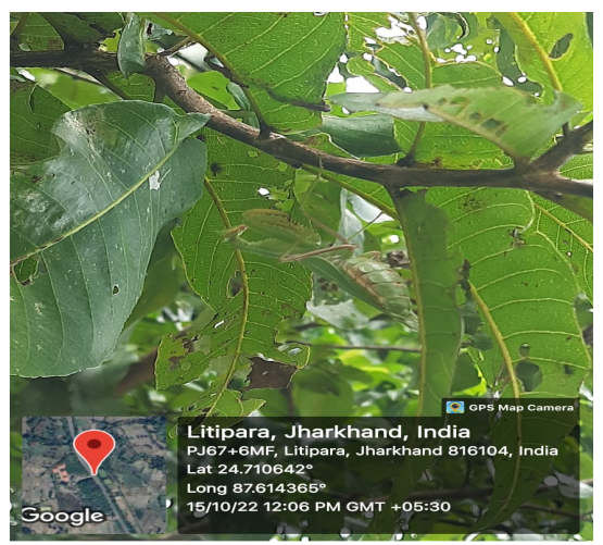
a. Praying mantis (Hierodula spp.)

to be caused in this region is due to Sycanus collaris . Although pest and predators were known, but systematic assessment to quantify the numbers of the pest attracted to the Tasar silkworm were presented for the first time. The time of peak activity has potent implication in disease management. Since Tasar silkworm is reared under field condition owing to its' wild nature, a specific time for attack of the pest would be in convenience to disease management.