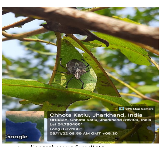
c. Eocanthecona furcellata