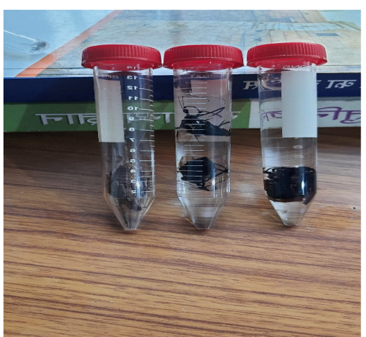
d. Collections made